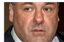
Gandolfini Was 'Walking Time Bom... Newsmax