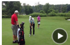
Hear Zach Johnson knock down the pin on Jul 9, 2013