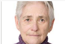
Do These 7 Things and You'll Get Newsmax Health