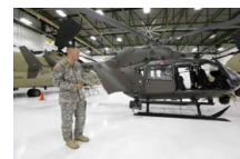
New Iowa National Guard helicopters