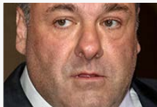
Gandolfini Was 'Walking Time' Newsmax