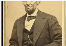
Surprising Abraham Lincoln Descendants ancestry.com