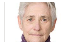
Do These 7 Things and You'll Get Newsmax Health