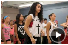
A Movement Lifestyle leads dance class in De... Jul 7, 2013